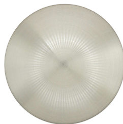
Brushed Nickel 300960BN