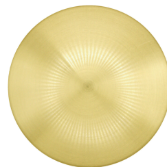
Brushed Gold 300960BG