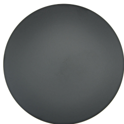
Matte Black 300960BK