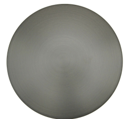
Gun Metal 300960GM

Dimensions are approximate. Information in this technical overview is representative of the product available at the time of printing. Due to our policy of continuous product development, the design and specifications depicted are subject to change without notice. Please confirm all particulars prior to installation.