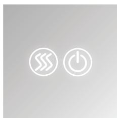
Touch sensors for light and demister

While we aim to ensure specifications are correct at the time of publication, Fienza reserves the right to make modifications without prior notice. Physical colour may vary from image shown. All measurements are shown in millimetres. Always use physical product measurements for mark-ups and roughing-in as the technical drawing may differ from actual product received.