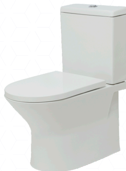
EMILIA FLUSH TO WALL SUITE WITH EMILIA SLIM TOILET SEAT